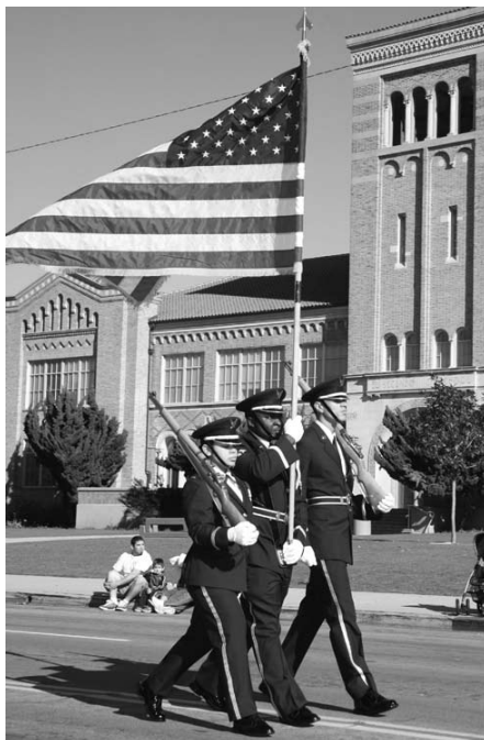
The Los Angeles Air Force Base Color Guard leads the 44th Annual Holiday Parade down Main Street.

Cub Scout Packs 968 and 773 carried the banner for the Chamber of Commerce. The Chamber would like to thank Parade Sponsors, Plaza El Segundo, Chevron Products Company, S&S Hardware, Thomas Properties Group and the City of El Segundo for helping to make the 44th Annual Holiday Parade possible.