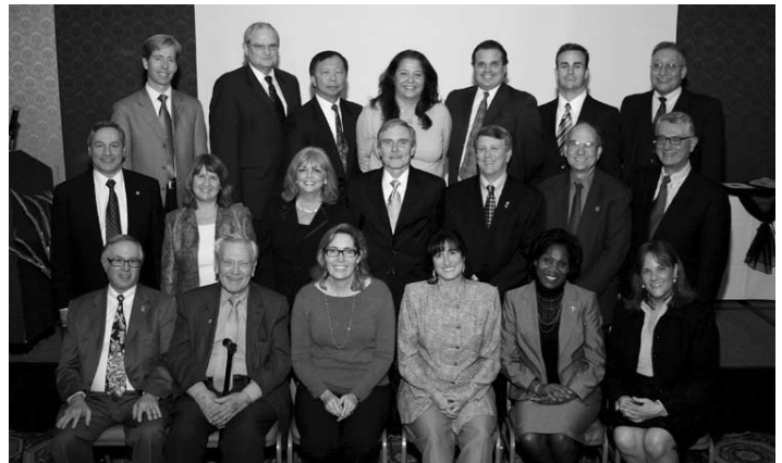
2008 Board of Directors