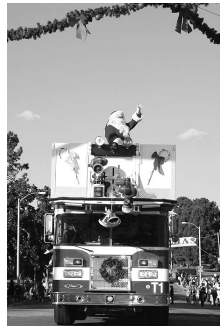
Just what the kids were waiting for...bringing up the end of the parade is Santa riding high in the Chevron Fire Truck.