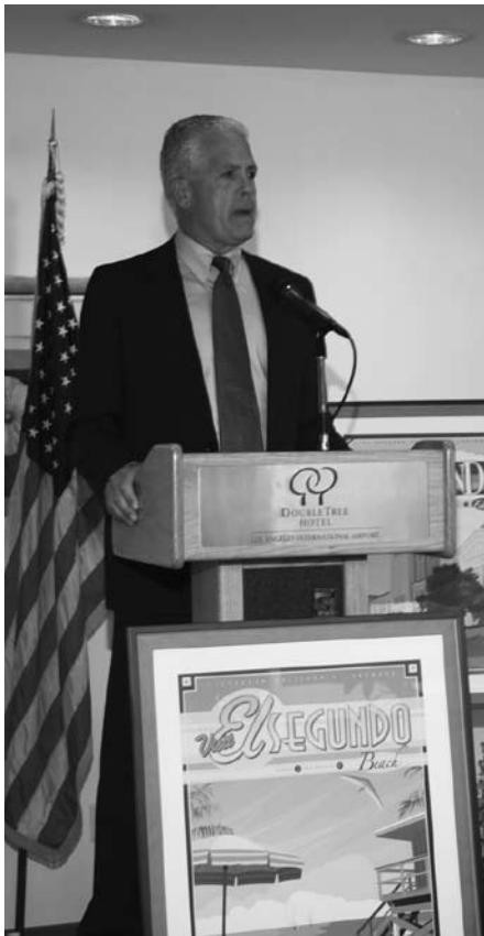
Mayor Kelly McDowell addresses a sold-out crowd at the Annual State of the City Address.