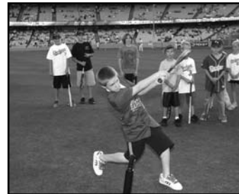
El Segundo Little Leaguers and other lucky Dodger Day ticket holders take batting practice on the field at Dodger Stadium.