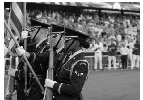
The Los Angeles Air Force Base Honor Guard at Dodger Day