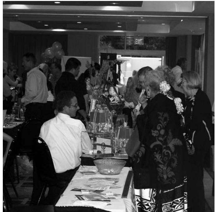
The crowds enjoy the displays, food and networking at the 2008 Back to Business Expo.