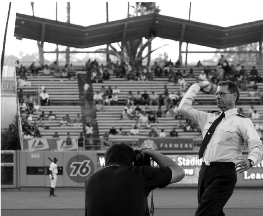
General Sheridan of the Los Angeles Air Force Base throws the first pitch at El Segundo's Annual Dodger Day.