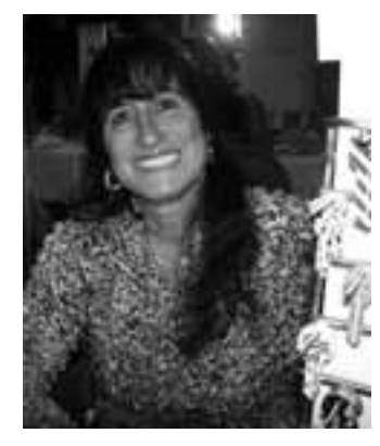
Industrial Lock & Security