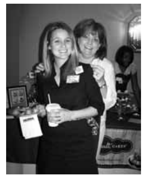
Paychex & Nothing Bundt Cakes