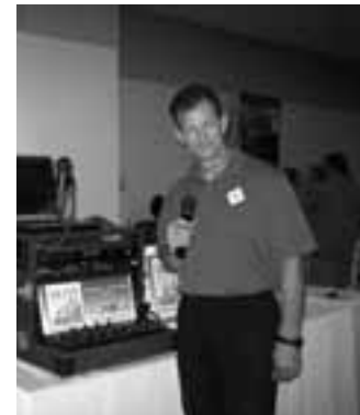
Sounds Like Fun