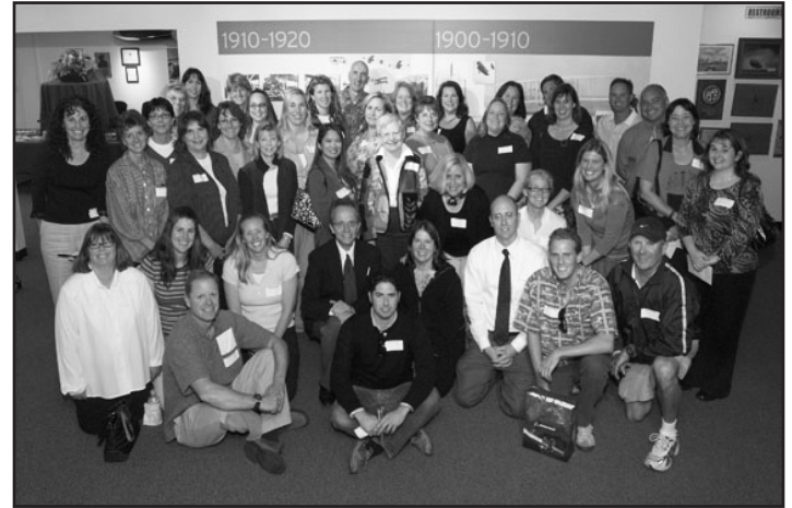
More than 45 mini grants were provided to the teachers of the El Segundo and Wiseburn School Districts from local chamber businesses.

The Boeing Company hosted the 6 th Annual Salute to Businesses Supporting Education Event on November 17 at the Flight Path Learning Center. This event provided teachers and the businesses that provided mini grants and additional support throughout the year an opportunity to meet each other.