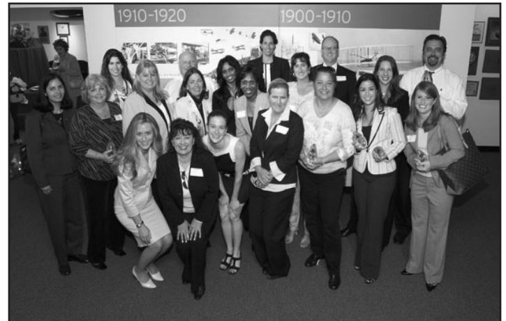
Many chamber businesses were given awards by the education community for their contributions to the El Segundo and Wiseburn School Districts.